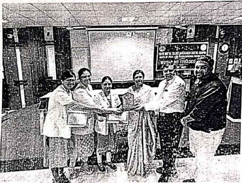
Interdepartmental painting competition won by Dept. of Conservative dentistry & Endodontics

[Handwritten Signature] HEAD OF THE DEPARTMENT PUBLIC HEALTH DENTISTRY VSPM'S DENTAL COLLEGE & RESEARCH CENTRE, NAGPUR-19 (M.S.)