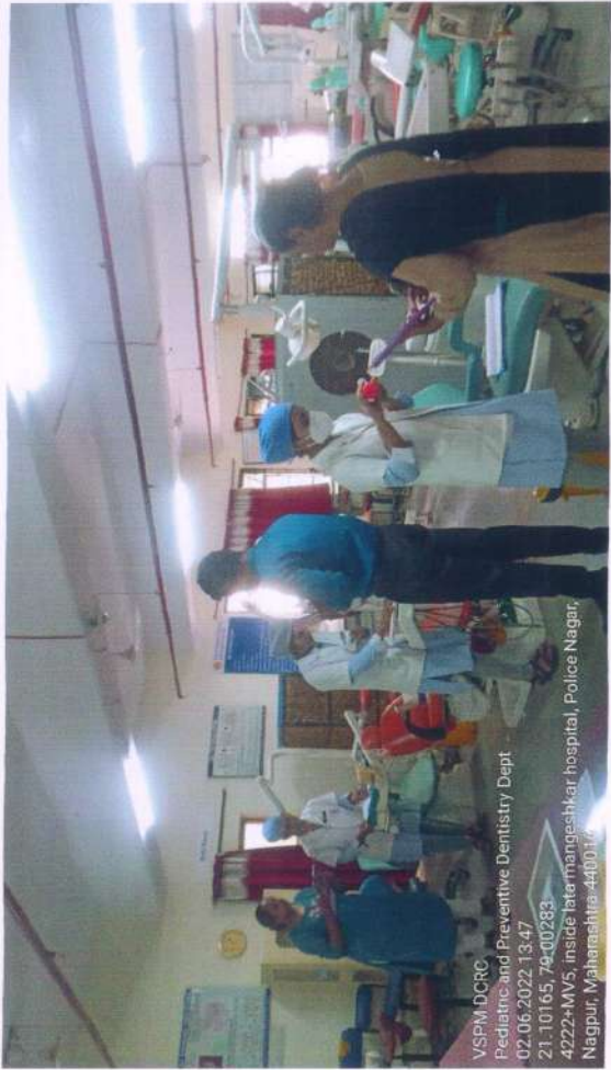
VSPM DCRC Pediatric and Preventive Dentistry Dept 02.06.2022 13:47 21.10165, 79.00283 4222-HMS, inside Jaramangeshkar hospital, Police Nagar, Nagpur, Maharashtra-440019